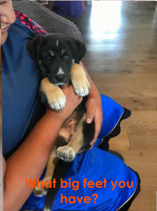
What big feet you have?