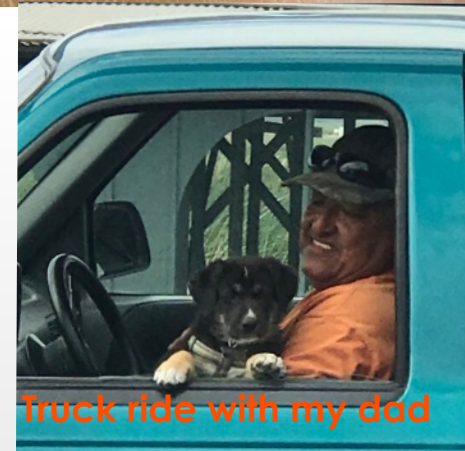
Truck ride with my dad