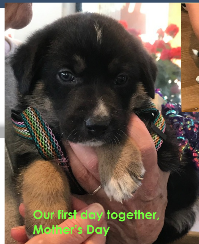
Our first day together, Mother's Day