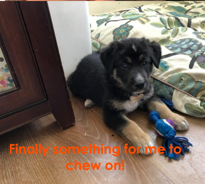
Finally something for me to chew on!